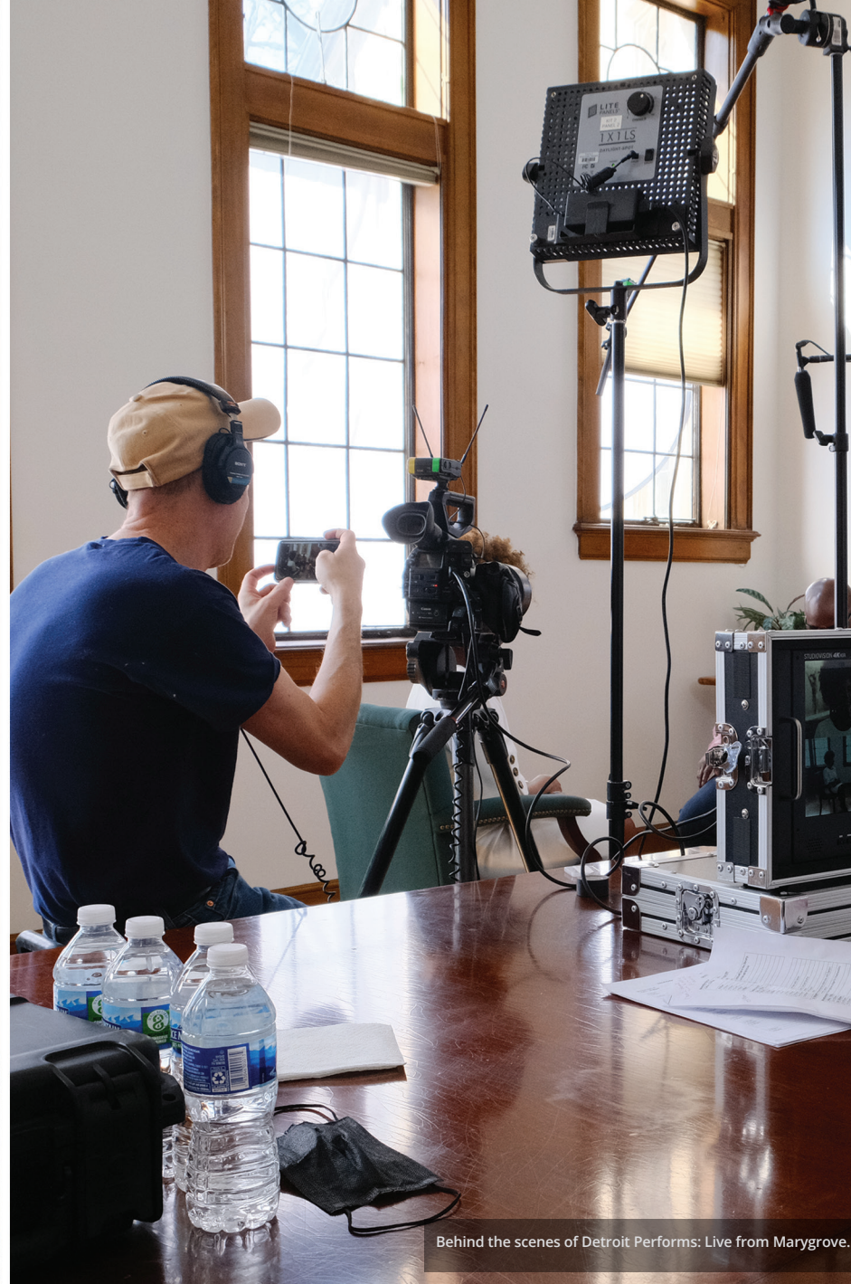
Behind the scenes of Detroit Performs: Live from Marygrove.