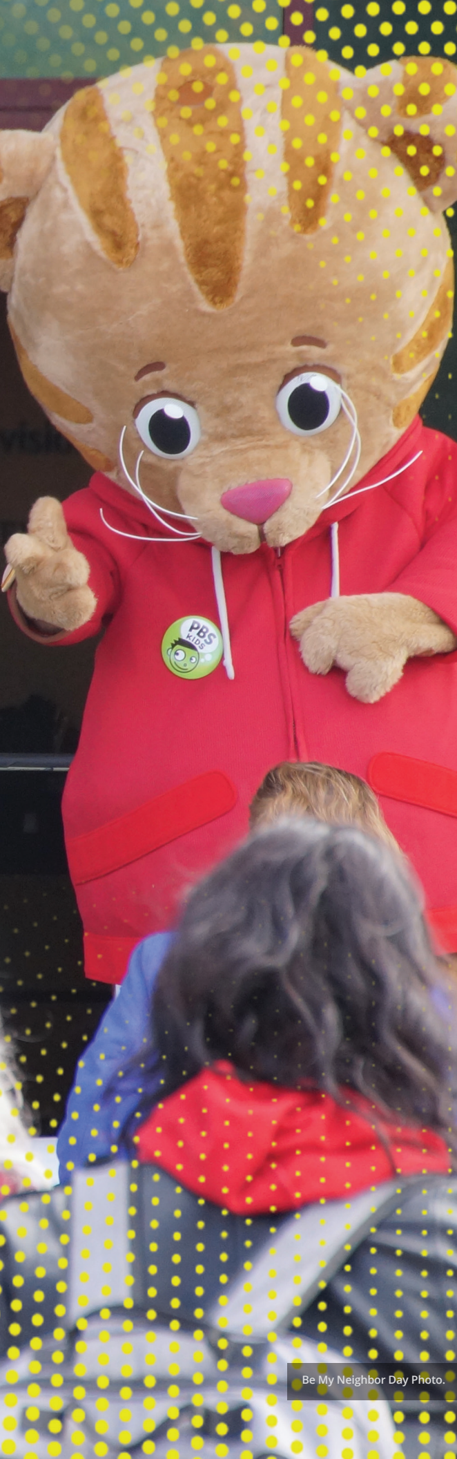
Be My Neighbor Day Photo.