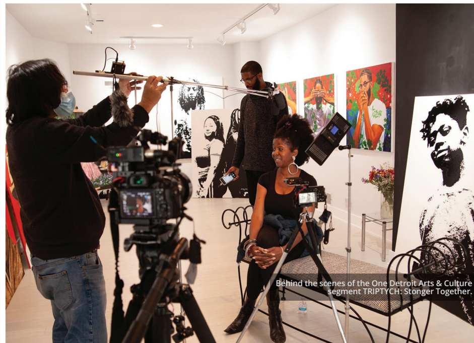
Behind the scenes of the One Detroit Arts & Culture segment TRIPTYCH: Stonger Together.