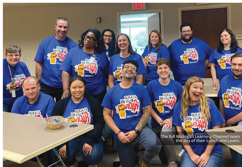
The full Michigan Learning Channel team the day of their Lunch and Learn.