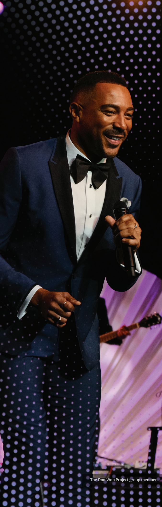
The Doo-Wop Project group member.