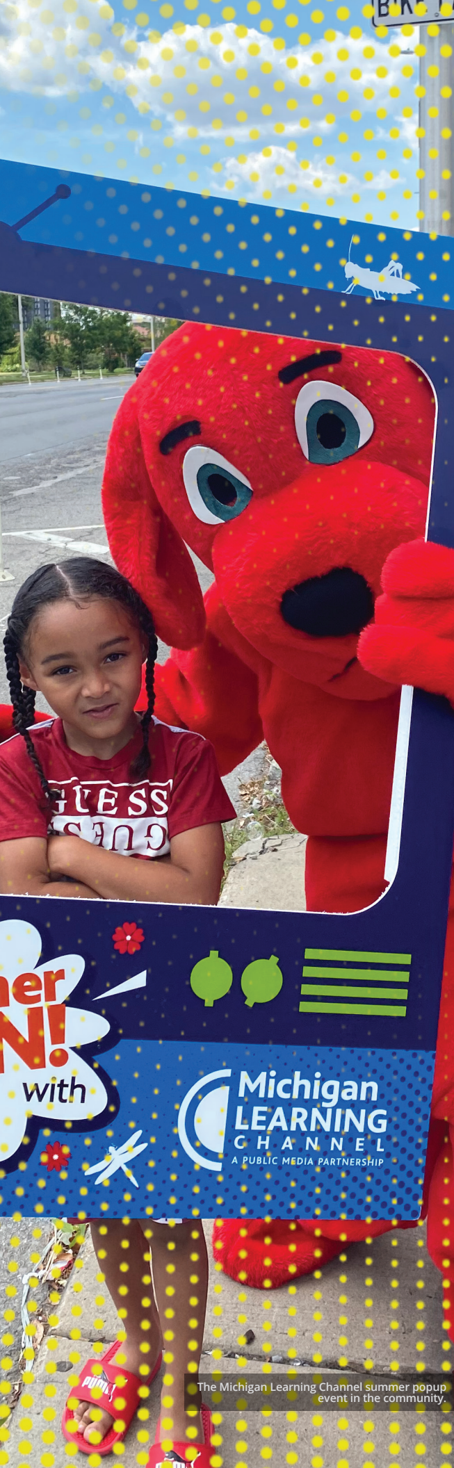
The Michigan Learning Channel summer popup event in the community.